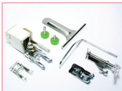
Quilting Set Included