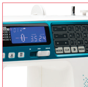
Easy Navigation and LCD Screen